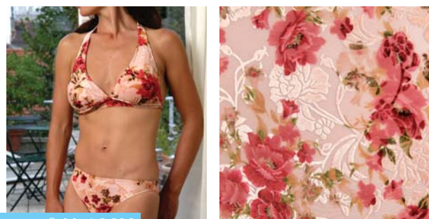
creora ® H-100X

H-100X sets the bar high for those looking to maintain the luxurious feel and fit standards so critical in meeting the consumer's needs in apparel.