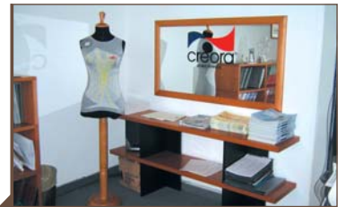
• Show room Milano •