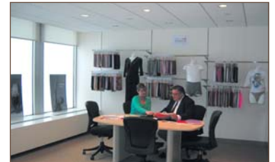
• Show room New York •